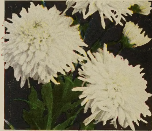
WINTERSET. 60c each; 3 for $1.50